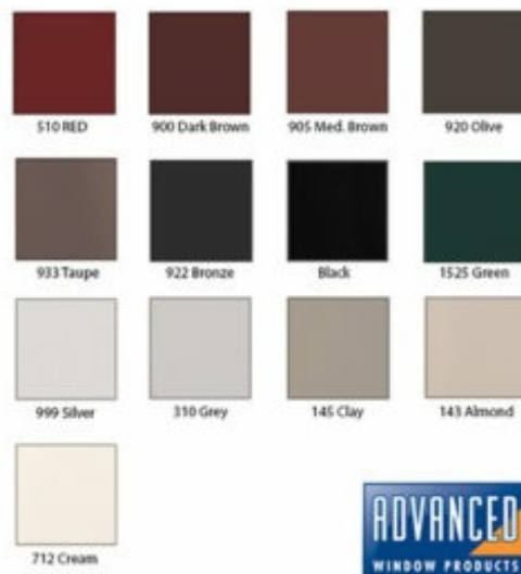
Window Frame Exterior Colors

When it comes to color options for window frames, there are many options to choose from. You can narrow down our options by figuring out what style your home is, and what style you want. For a traditional style, the color of the window frame should pop out, or contrast, with the colors of the house. For a modern style, we want the color of the window frames to be similar, or blend in with the colors of the house. Another way you can narrow down your color options is deciding what color palette you like best, or looks best on your home. Warm colors , which consist of reds, yellows, oranges, and browns, typically feel more traditional . For a more modern feel, cool colors might be better , which consist of greens, blues, purples, and grays. Keeping the colors of the house in the same palette, cool or warm, keeps the look coordinated. There can still be contrast, such as beige frames for windows in a red brick house. White and black as colors exist outside these color palettes and work with either set.